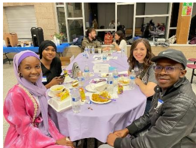
7th Annual Ramadan Interfaith Iftar 2023