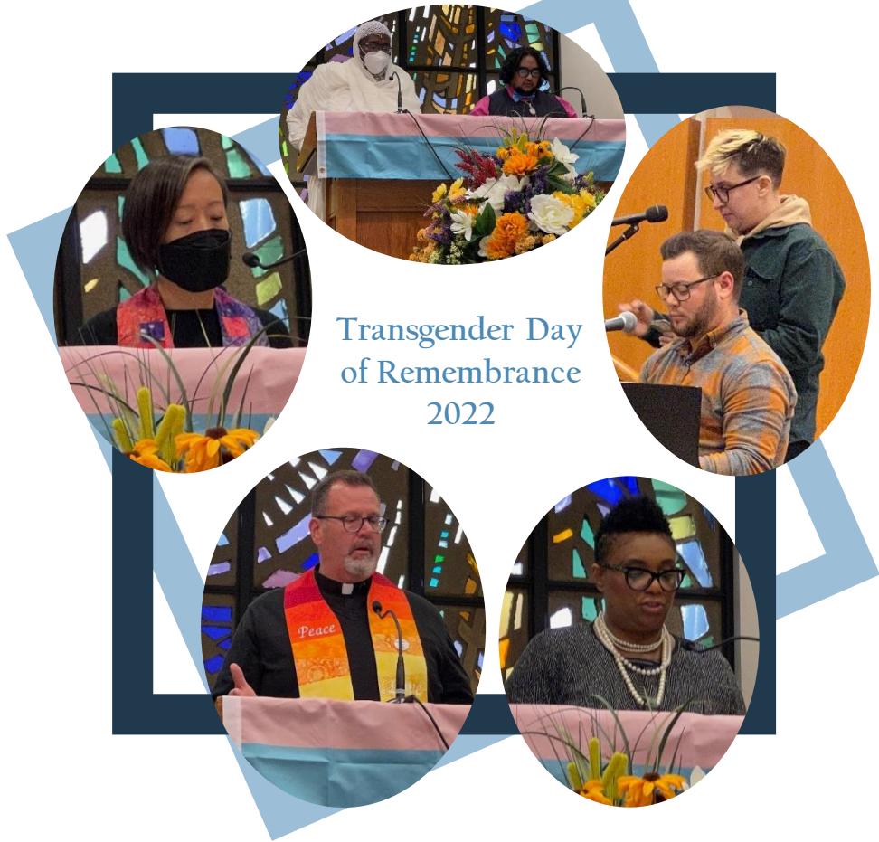
Transgender Day of Remembrance 2022