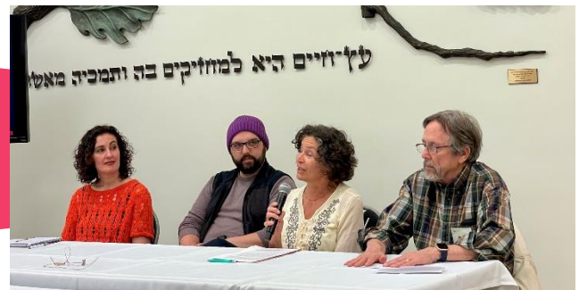
Interfaith Intersections At Temple Beth El Madison

Glass Nickel Pizza Hy-Vee Istanbul Market Steep and Brew Taza Mediterranean Kitchen