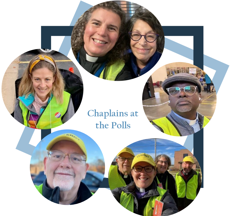
Chaplains at the Polls